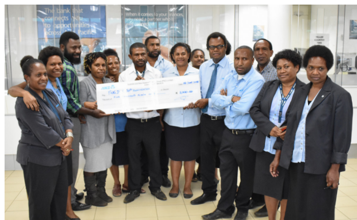
ANZ branch manager and staff presenting a dummy cheque to the colloquium committee