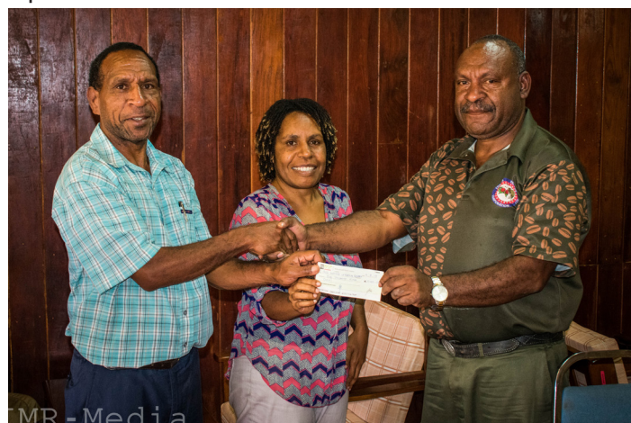
CEO of Coffee Industry Corporation (CIC) presenting a cheque to the Colloquium co-chairs.