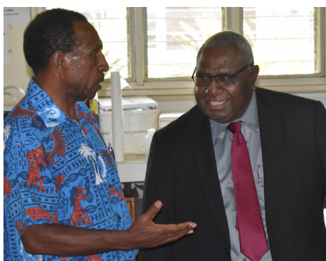
Honourable Minister Wera Mori at PNGIMR