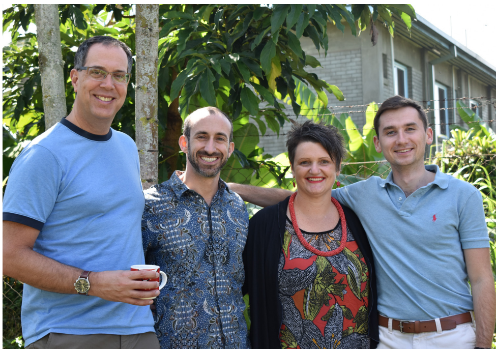
Team from US providing training on data analysis & writing on IBBS project