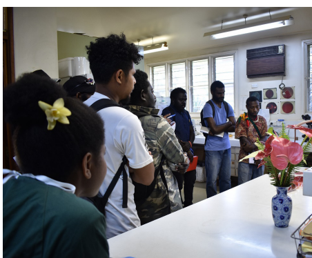
UOG students visiting PNGIMR Labs