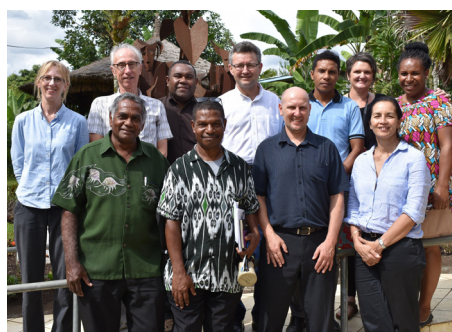
Australian DFAT Health Security team